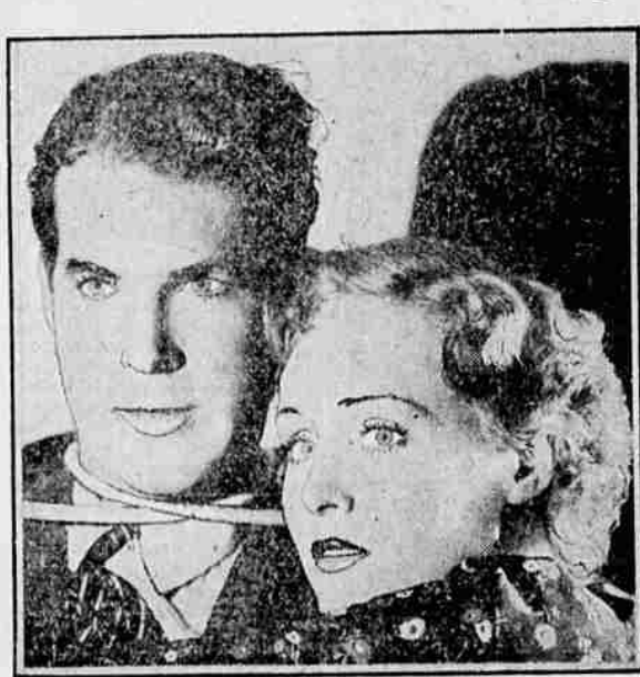
Upper left, Joe E. Brown in "Alibi Ike," at the McDonald Sunday; above, Hardie Albright and Mary Carlisle, stars of "Champagne for Breakfast," at the Mayflower; upper right, Karloff and Lugosi in "The Raven," Heilig thriller; lower right, Fred MacMurray and player in "Men Without Names," coming Thursday to the Rex.

puts two and two together and makes seven or eight.