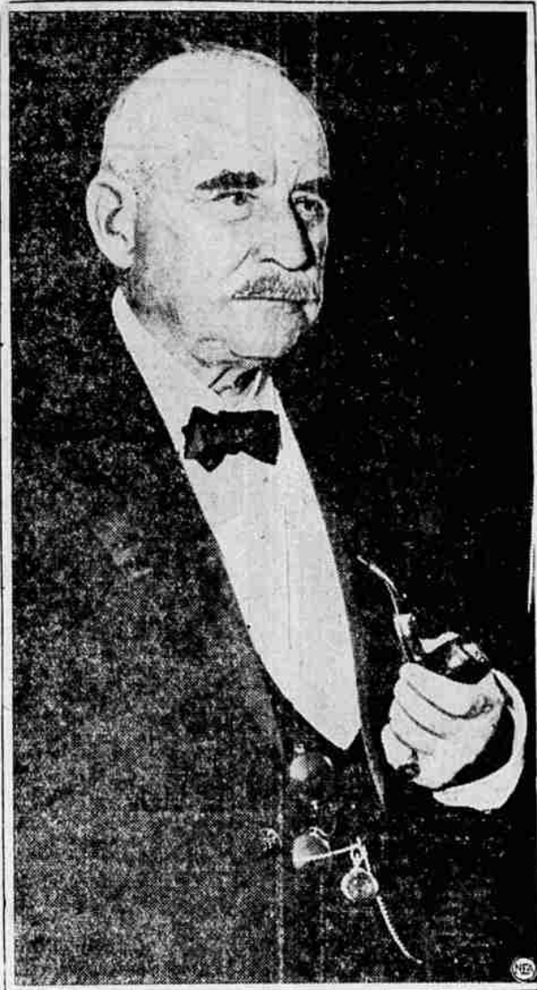
A camera study that brings out with striking faithfulness every facial feature of America's greatest financier is this latest, exclusive picture of J. P. Morgan, taken as he sailed unrecognized by the public, for Europe, on the Aquitania. The attitude is typically Morganesque, the man of millions standing with mouth tightly closed, jaw firmly set, and keen eyes gazing directly ahead, with his favorite pipe gripped in the left hand giving the last characteristic touch.