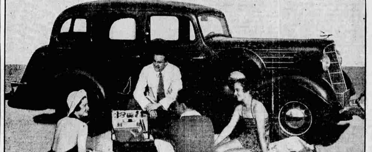
... and we've forgotten what repair bills look like!

When you look at Terraplane's smart, sweeping lines—consider the extra size and roominess of Terraplane bodies—get the thrilling smoothness of Terraplane performance—it is hard to believe that this car is priced with the lowest. You can quickly prove that Terraplane gives you "top" performance. At any green light! On any hill! Over any stretch of road! And 36 official A.A.A. records for speed, acceleration, hill climbing give you added proof. There are many other advantages you won't find in any other lowest price car. Bodies all of steel! Police-tested Hudson brakes! Amazing economy—proved in nation-wide tests. The cool comfort of all-year ventilation, for summer driving.