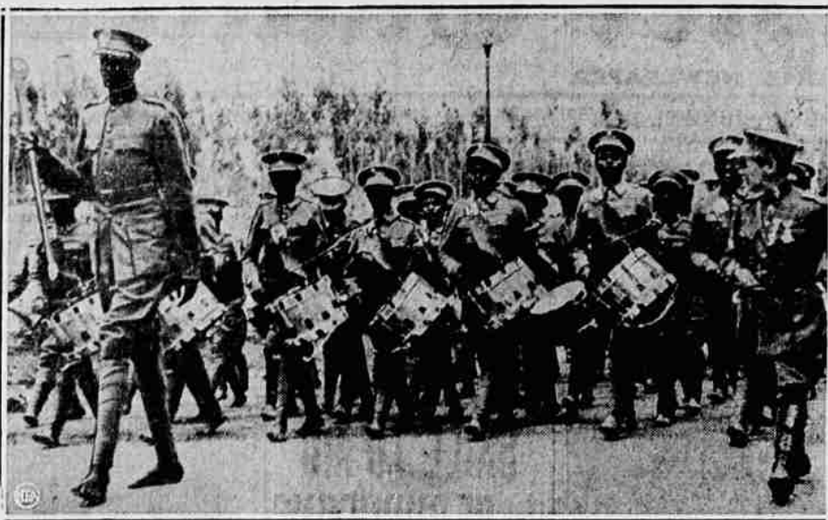
Here is a typical outfit of Ethiopia's bravest, marching through the dusty streets of Addis Ababa. Small chance against Mussolini's modern legions, you may think, but high mountain ranges protect the African kingdom, and forty years ago the soldiers of the "King of Kings" repulsed an Italian invasion with appalling slaughter. That is why Il Duce says Italy "has some debts to pay."