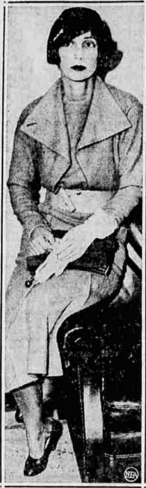
Shown arriving in New York aboard the Grace Liner Santa Clara is Princess Xenia Romanoff, the former Mrs. William B. Leeds. However, when she's behind her desk, she's just Miss Xenia Romanoff. A court order has legalized her use of the two styles of names.