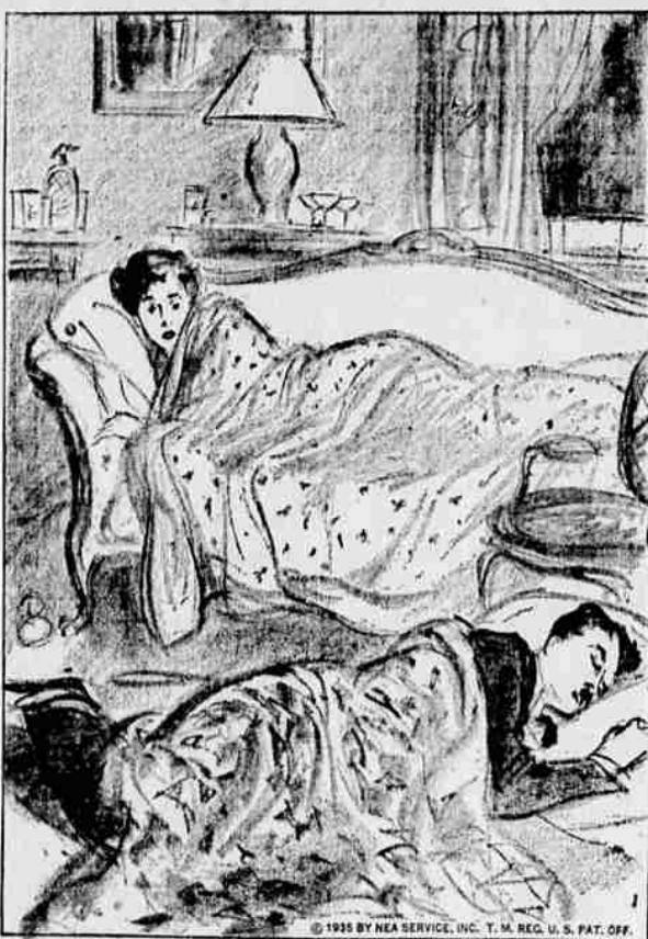
"You had better look around and see how many guests we have for breakfast."