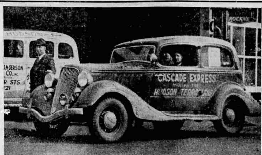
Above you see the Terraplane "Ruggedness Run" car, which appeared in Eugene last Thursday at the Monroe Motors. The machine is covering 14,000 miles in as many days, and when here it was on the eighth day of its run.