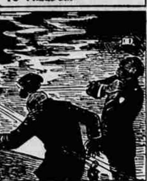
TRAPPED, AN UNIDENTIFIED SAFE-CRACKER BLASTS HIS WAY TO FREEDOM-

The Best of the Nation's "Human-est" and Funniest Comics On This Page Daily