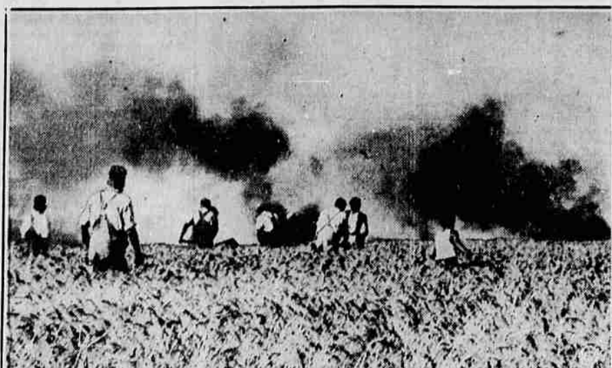
Destruction of this tract of wheat was completed by flames, after the grain barely had survived the long drought, with most of the able-bodied population of Clearwater, Kan., fighting fruitfully to halt the blaze. A strong wind sent the fire raging through a mile of the wheat before it was quelled upon reaching a highway.