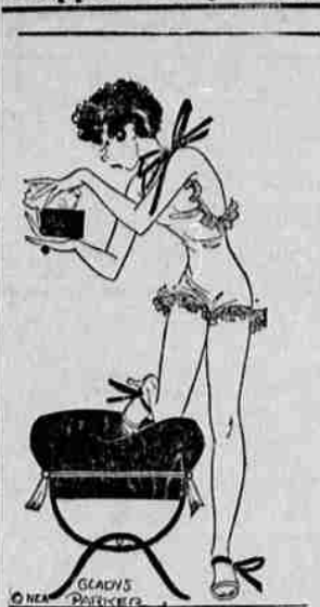
Powder is a girl's ammunition to keep in arms.