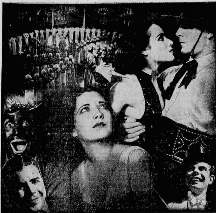
This cameraman has caught the mood, spirit and tempo of the First National mammoth musical drama, "The Wonder Bar," which opens Saturday at the McDonald theatre. Here you see several of the stars, a portion of the chorus and some of the settings. Stars in the picture, from left to right, Al Jolson, Dick Powell, Kay Francis, Dolores Del Rio, Ricardo Cortez and Hal LeRoy.