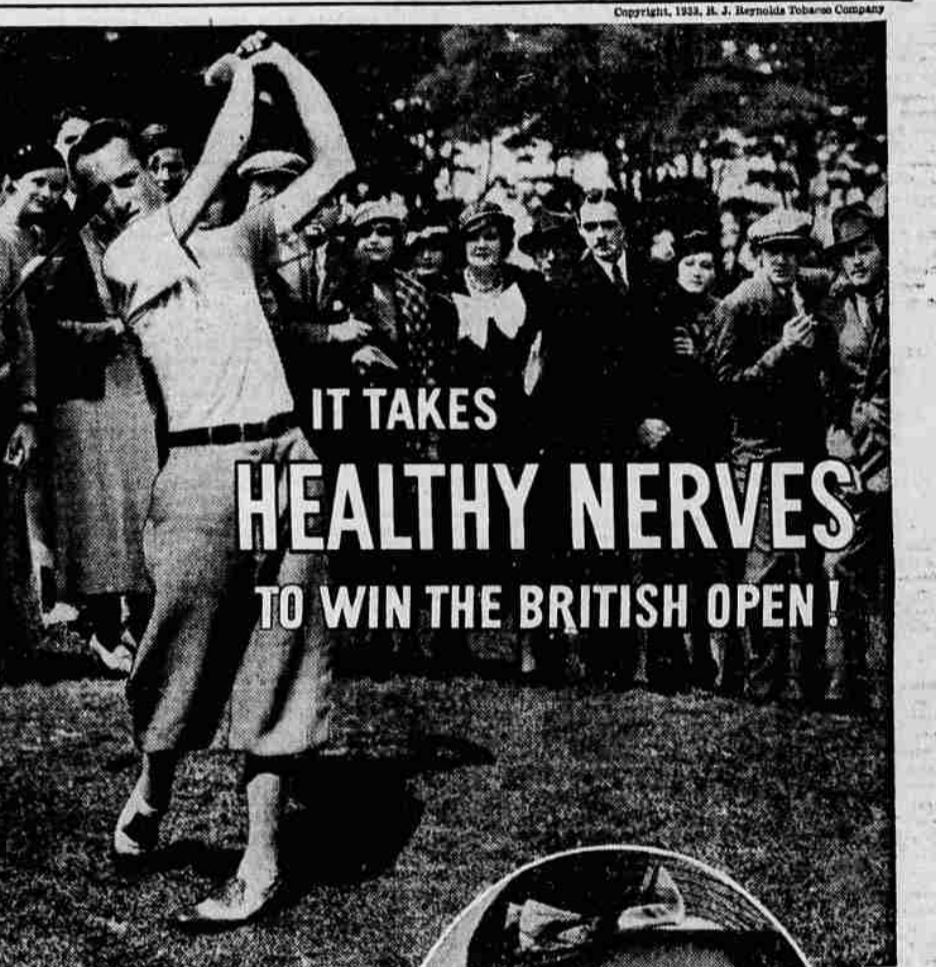
ABOVE—IN RATING THE POPULAR CIGARETTES, Shute says, "Camels are milder, and what is even more important to any golfer, they do not jangle the nerves."

The Store Of A 1000 Barabars Williams Self Service Store