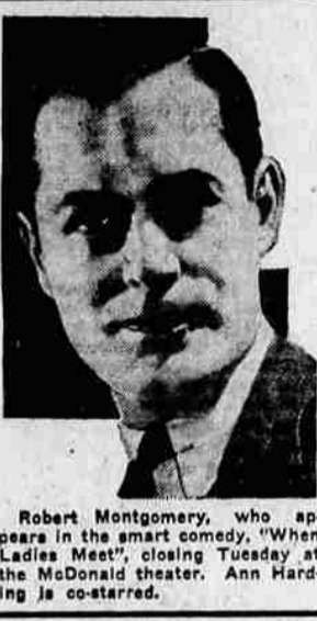
Robert Montgomery, who appears in the smart comedy, "When Ladies Meet," closing Tuesday at the McDonald theater.

MONDAY PROGRAMS McDONALD, "When Ladies Meet," with Ann Harding, Myrna Loy, Robert Montgomery and Frank Morgan. Closes Tuesday.