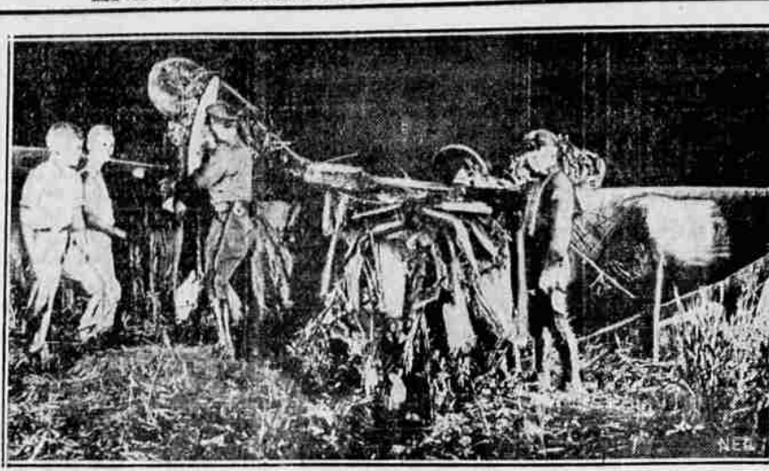
For lack of a few gallons of gasoline, the daring east-west Atlantic flight of James and Amy Mollison ended in the mud of a Bridgeport, Conn., swamp. Here is the wreckage of their plane "Seafarer." Forced to land 80 miles from their goal, after a 39-hour flight from Pendine Sands, Wales, the weary aviators overshot the landing field. Both suffered minor injuries in the crash.

association of Retail Clothiers and Furnishers.