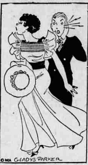
A home run often follows a strike-out in the social game.