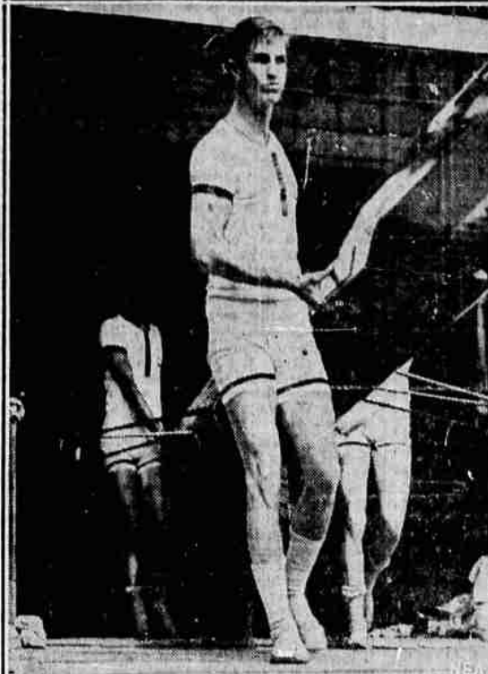
While his mother looked on proudly, Franklin D. Roosevelt, Jr., strapping 18-year-old son of the president, stroked the Groton School crew to a decisive victory over Belmont Hill School on the Nashua river at Groton, Mass. Here is Franklin, 6 feet 4 inches tall and tipping the scales at 180 pounds, aiding his crew mates in carrying out their shell for the race.