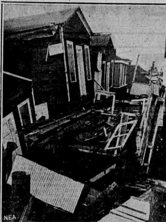
These battered and wrecked bungalows at Broad Channel, near Rockaway, L. I., give graphic evidence of the force of the gale that struck in from the Atlantic and lashed New York City and vicinity. Roofs and timbered walls were whipped about like paper scraps. Fifty persons were injured, three seriously, and heavy property damage inflicted. Three flimsy bungalows were whipped out to sea.