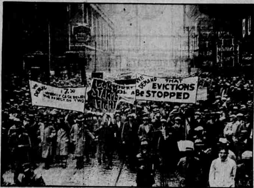
Twenty thousands idle Chicagoans marched through Loop streets to Grant park on the lake front in protest against reduction in emergency relief rations...