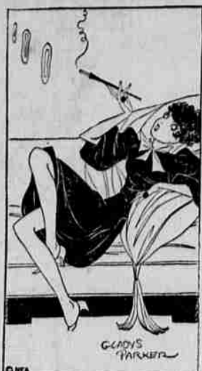
The only women who have their own way are those who don't have to make it.

merge or destroy or cripple the great social science schools of the State University, located at Eugene, which have held high the torch of social science research and education. To submerge or cripple these great schools would be the final and tragic act of a counterfeit leadership and a typically duped people, because EVERY MAJOR PROBLEM CONFRONTING SOCIETY TODAY, AS ALWAYS AND FOREVER, IS A SOCIAL SCIENCE PROBLEM. Must it be pointed out: