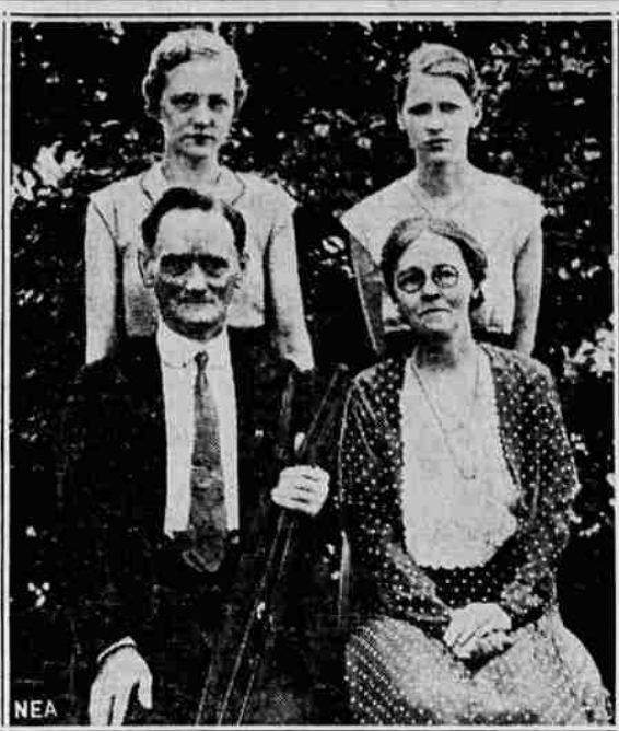
Their eyes are turned White House-ward. William D. Upshaw, the Prohibition Party's nominee for the presidency, is shown here with his family in a specially posed picture taken at their home in Asheville, N. C.