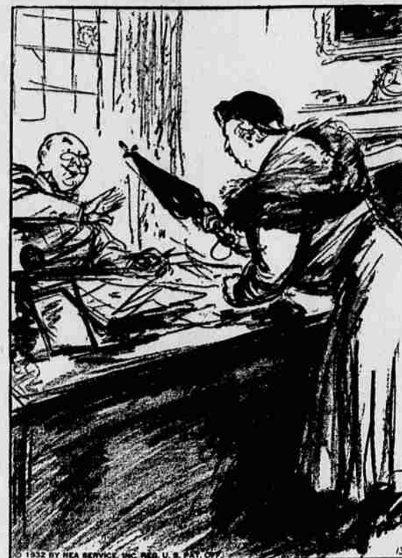
"I'm giving you fair warning! I'll give you two days to get that stock you sold me back up to par."