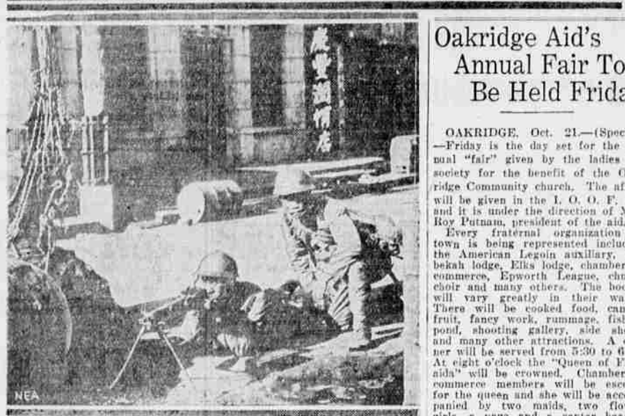
Above is a graphic action picture from the Manchurian war zone; Japanese field artillery firing in the advance of Mukden. The battery commanders are shown at their telescopes at the left, and at the extreme right, a field piece is just being fired. Below, Japanese troops have taken a control of Mukden, former Manchurian capital, and this picture shows a pair of sentries, with automatic rifle, guarding an street intersection.