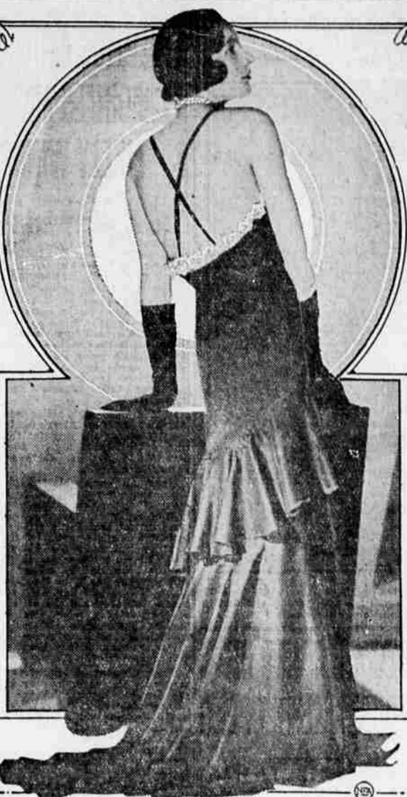
Startlingly smart and sophisticated is this black flounce evening gown from LeLong that has sleek, fitted lines, low hip flounce, trailing fullness in its long skirt and a formal decollete of the new camisole cut.