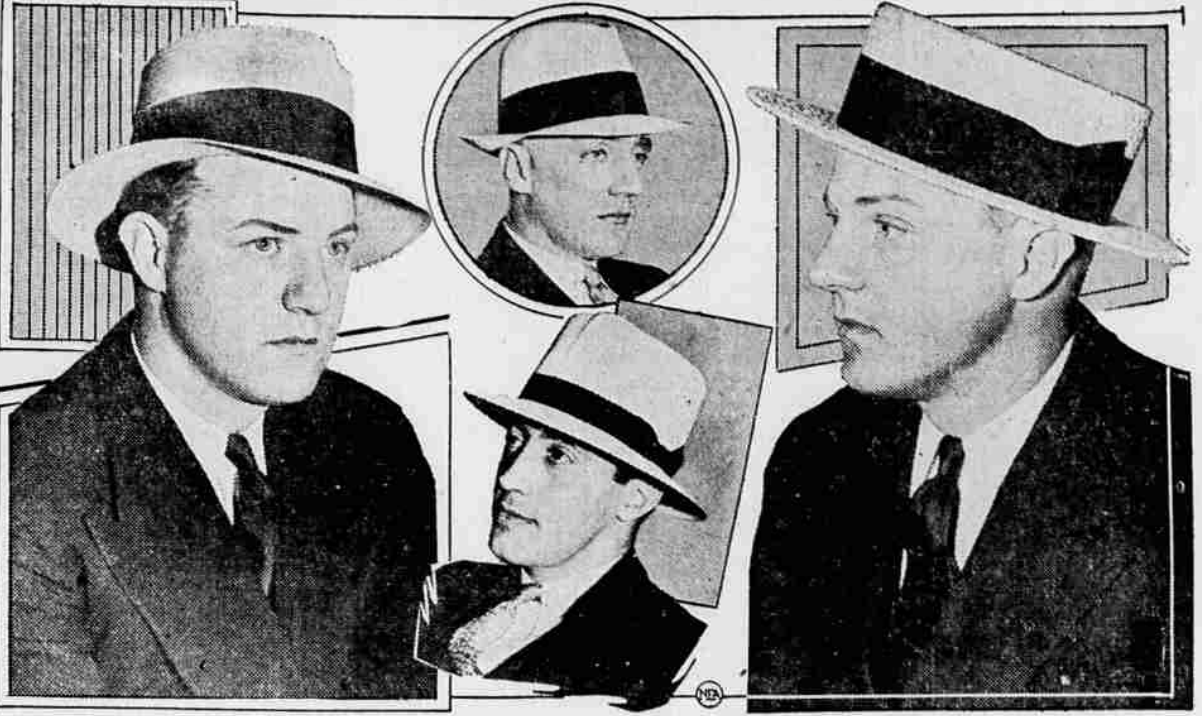
The 1931 group of straw hats show a predominance of the Sennet straw (right) worn slightly atilt, the leghorn (left) which is more apt to be natural tone or some gay color than cream, and the Panama which may take a wide band (upper inset) for the older man, who is apt to flip the brim up in the back and down in the front, or a narrow band (lower) for the young man about town who may prefer to wear the brim pulled down all the way around.