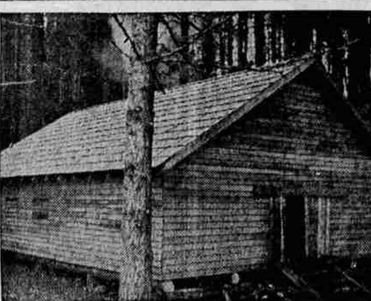
Here is the community clubhouse which was built by the people of Carnas Swale and was to be used for the first time in connection with Christmas festivities. The men of the community built the clubhouse in their spare time, and materials were also donated.