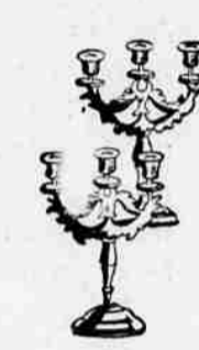
Brass Candelabra $3.25