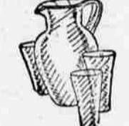
Heisey Water Sets $2.75