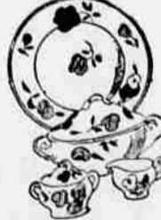
12-Pc. Jasmin Dinner Set $12.50