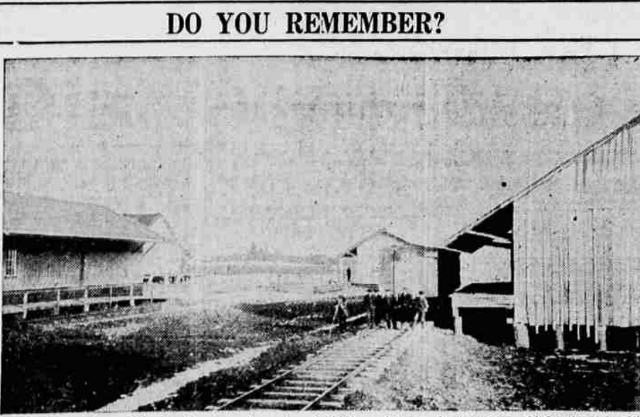
Here is another of the Register-Guard's series of old-time pictures. It shows the old Southern Pacific station, as it was in the 'eighties. The passenger station will be seen in the background, with an old-fashioned station platform. This was approximately the location of the present station.