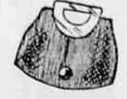
Calfskin Bags $3.95