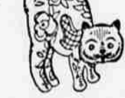
Bath Salts in Novelty Container $1.00