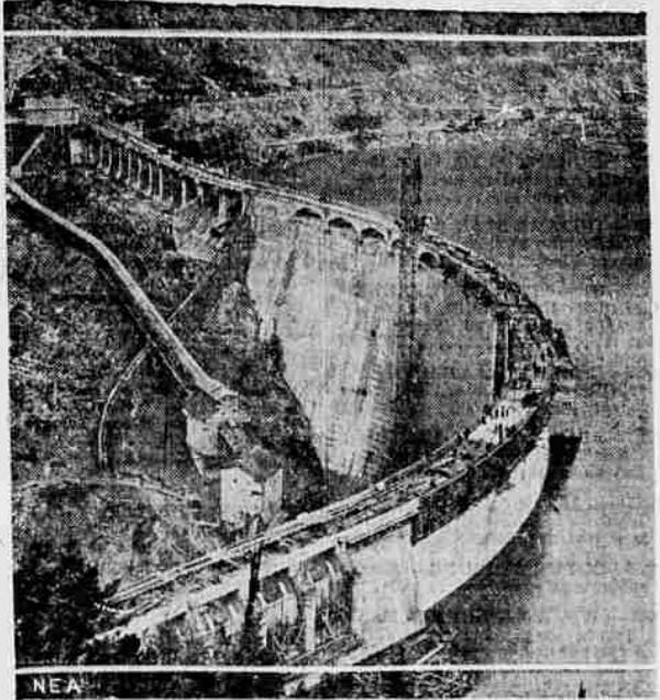
Here is the first photo showing Seattle's new Diablo Dam since the water began to rise. Highest arch type dam in the world, 384 feet at a cost of $5,000,000 and will have a storage capacity of 90,000,000 acre feet.