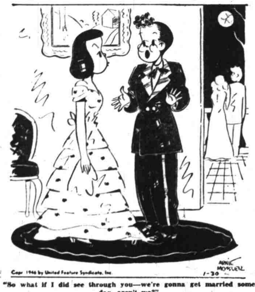
"So what if I did see through you—we're gonna get married some day, aren't we?"