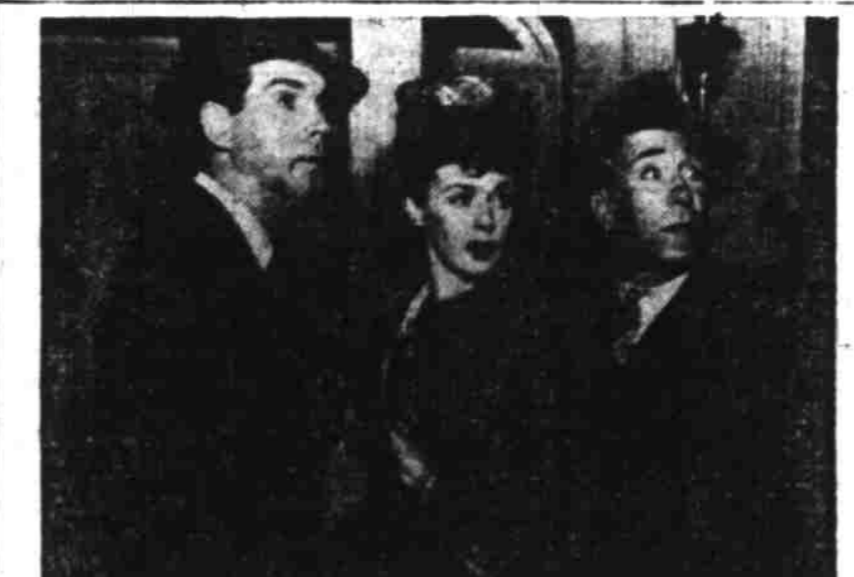
Fred MacMurray and Marguerite Chapman seem to expect the worst in this scene from "Pardon My Past." Opens today at The Elsinore.