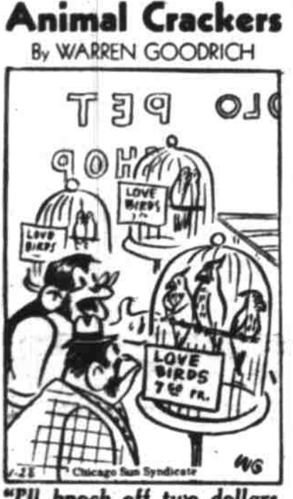
"Pil knock off two dollars on this pair if you'll take the mother-in-law too."

Nevertheless, executive headquarters bolstered its staff in order to send more mobile teams into the field where agreements have been reached between Chinese central government and communist local commanders in combat areas. It is planned to expand the original eight truce teams to as many as 23.