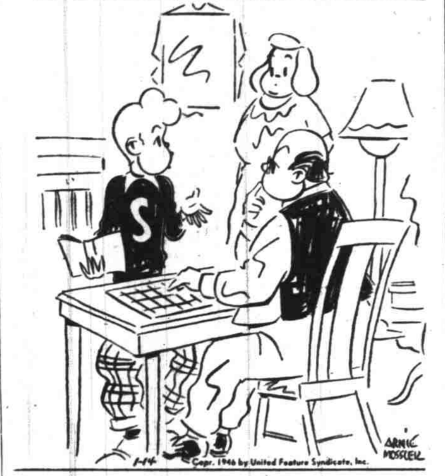
"Don't worry, mom—I can easily get my homework done while pop's plotting his next move!"

KOAC - Friday - 5:00 k.c. - AM - 20:00 News, 10:15 For Women, 11:00 Concert Hall, 11:45 Research, 12:00 Noon News, 12:15 Noon Farm Hour, 1:00 Treasury Salute, 1:15 Air School, 1:45 Amer. Pageant, 2:00 Women, 2:30 Memory Music, 3:00 News, 3:15 Music Off.