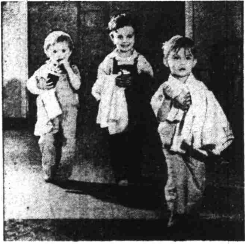
The American Cancer society, in pointing out a "common misconception" says that cancer kills more children between the ages of 5 and 19 than are taken in the combined toll of scarlet fever, infantile paralysis, typhoid fever, meningitis, peritonitis, diphtheria, dysentery, diarrhea and malaria. The above picture of three victims in the Memorial Cancer center, which will share in the current campaign for research funds.