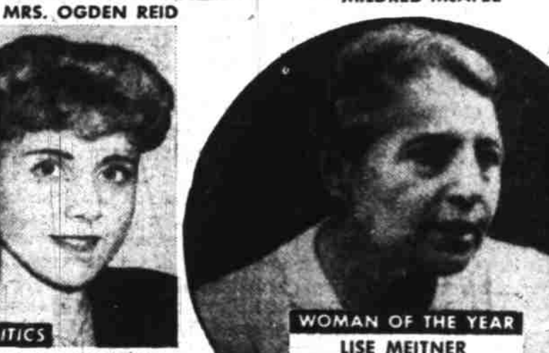
LISE MEITNER CLARE BOOTHE LUCE