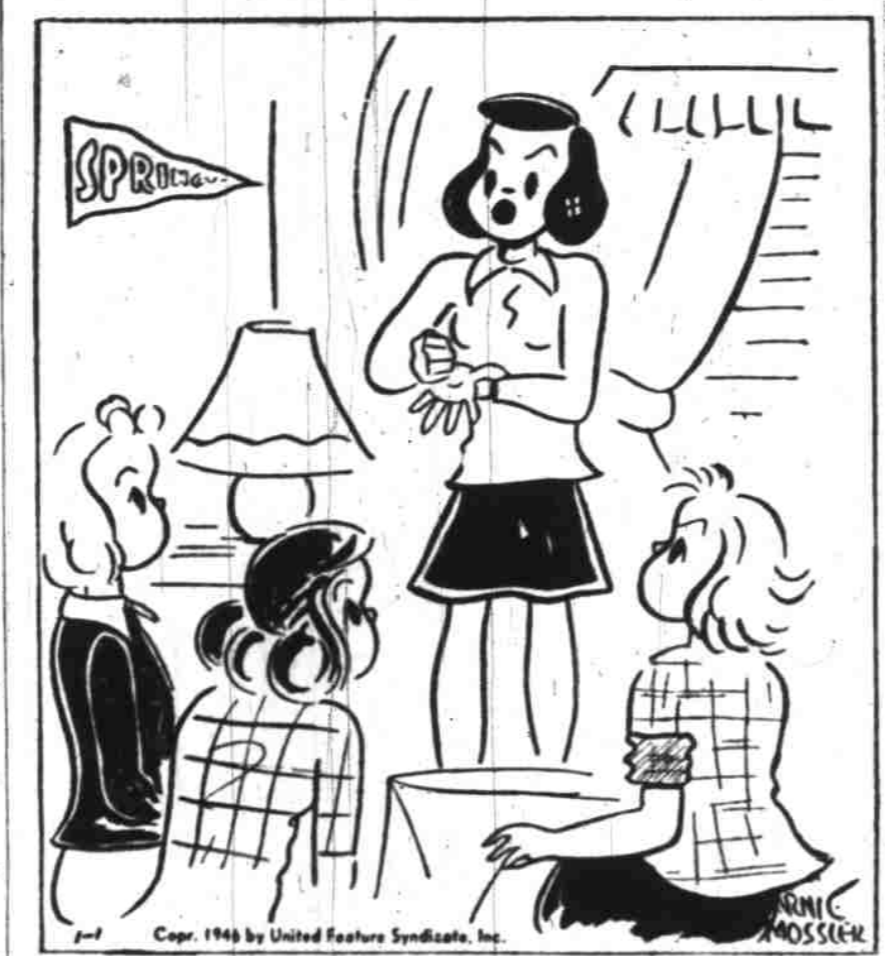
"And from New Year's on, I resolve that the fellows must start asking us for the dates!"