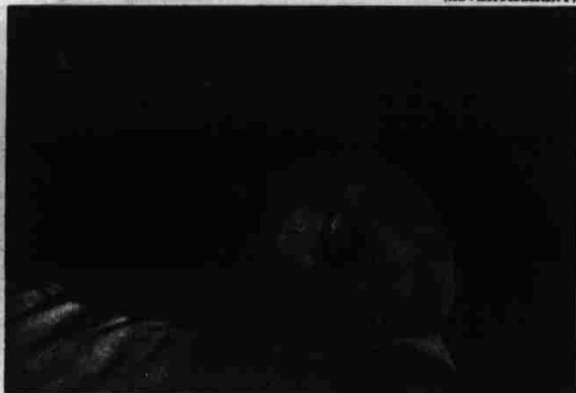
SLEEP STAGE 4. DEEP ... heart beat sometimes slows down 20 to 30 beats a minute.

of mattress—Beautyrest—gave longer periods of sounder Stages 3 and 4 sleep than any of the others.