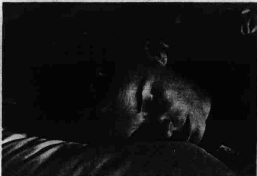
SLEEP STAGE 3. MODERATELY DEEP ... mind and body now getting recuperative rest ...