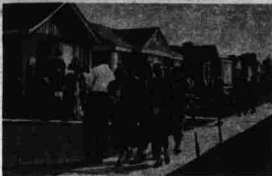
When "Open House" days roll around, prospective buyers inspect homes. Knowing what to look for helps.

probably get a lot of waste space and not enough closet space. In addition, you'll find that remodeling is very expensive. In any case, have the house checked by an architect or appraiser. And as you'll probably be dealing directly with the seller, have a lawyer there to protect your interests.