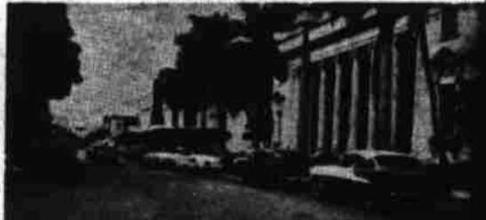
Prosperous Fort Myers, just 17 miles away, offers you in addition, miles of sunny sandy beaches, wonderful stores, 29 different churches, a tremendous modern hospital, fine banking facilities, and all grades of schools, with free school bus service supplied to Lehigh Acres.