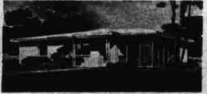
THE DOCA GRANDE — 1958 model B Two bedrooms, one bath, a shining kitchen and convenient utility room... and plenty of living area in its large living room and 10' x 17'8" screened porch! Convenient Terms $7,450 plus lot

BEST OF ALL—YOU CAN BUILD NOW OR WAIT TILL LATER, AS YOU PLEASE!