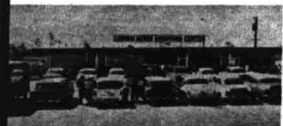
Lehigh Acres has its own modern shopping center, convenient to everyone... with a supermarket carrying all foods, sundries, drugs, tobacco goods. A Snack Bar, fine Dress Shop, and a Cities Service station and garage are included.