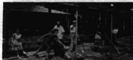
In the spacious new community center are shuffleboard courts, children's playground, picnic grounds, baseball diamond, horse-shoe courts and snack bar. In the screened pavilion overlooking the lake, the Wednesday night Card Club meets, and dances are held on Saturday nights for all ages!