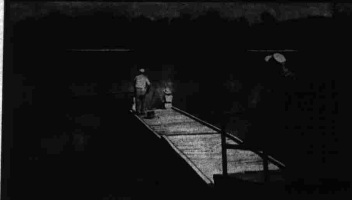
Right at the doorstep of all Lehigh Acres residents is beautiful, natural, Leeland Lake—well-stocked with many different varieties of fresh-water fish, and wonderful for boating, too. The lovely, 100-acre wooded lakeshore section is the site of the Lehigh Acres Recreation Center, local point for the wonderful community life here. A country club, with its own swimming pool is planned—a non-profit club with Lehigh Acres property owners as members.

NO INTEREST OR CARRYING CHARGES NO TAXES 'TIL LOT IS YOURS!