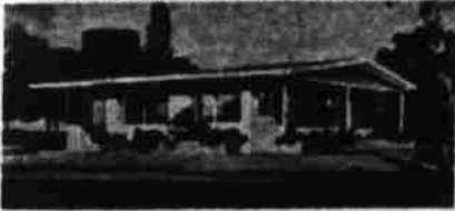
THE CARLETON — 1958 model F A spacious and airy one-bedroom home, with a 12' x 15' living room, compact kitchen, tile bath, large bedroom, utility room — and covered patio! Convenient Terms Only $8,880 plus lot

YOU CAN OWN YOUR OWN HOME AND LOT FOR AS LITTLE AS $745! 8 BRAND NEW MODELS OFFER 16 VARIATIONS TO CHOOSE FROM!