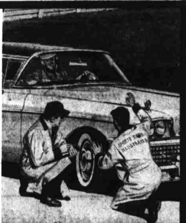
AT DAYTONA BEACH—NASCAR* made 176 brake-torturing stops in a row—at 60 mph—never gave the Buick CENTURY's air-cooled aluminum brakes a chance to cool off. Yet these aluminum brakes never smoked, faded, grabbed or pulled.