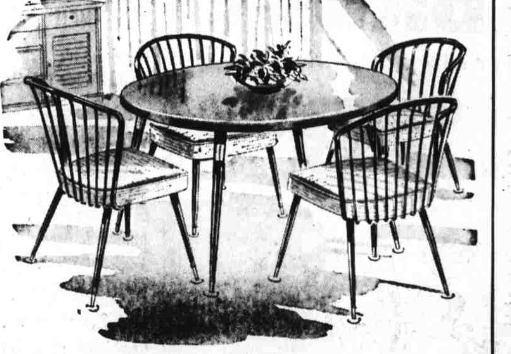
Five Piece Round Bronzefone Set

Reg. $83.85 Value Terms: As Low as $1.00 Down $1.00 Per Week $54.95 (Extra Chairs... $9 ea.)