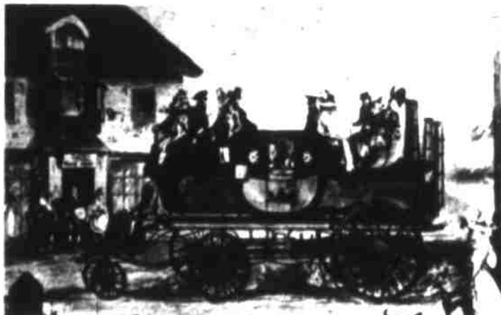
Steam-operated autobus huffed and puffed successfully from London to Beth in 1829, later made regular trips.