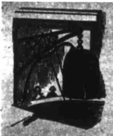
Dr. Beebe's bathysphere was nearly a century behind this diving bell which held inventor under water 4 hours.