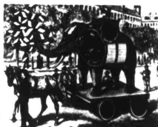
Madison Avenue denizens have nothing as flamboyant as elephant which "blew" leaflets to Parisians in 1880s.