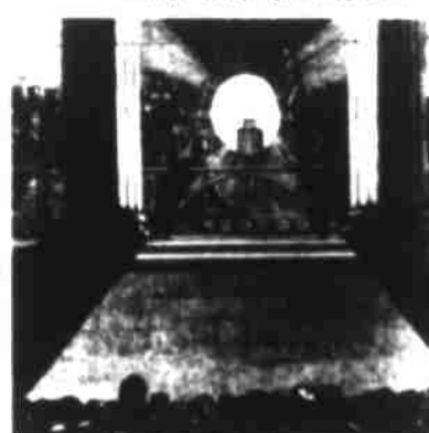
Demonstration of an electric light took place 30 years before Edison, using battery to burn pieces of charcoal.