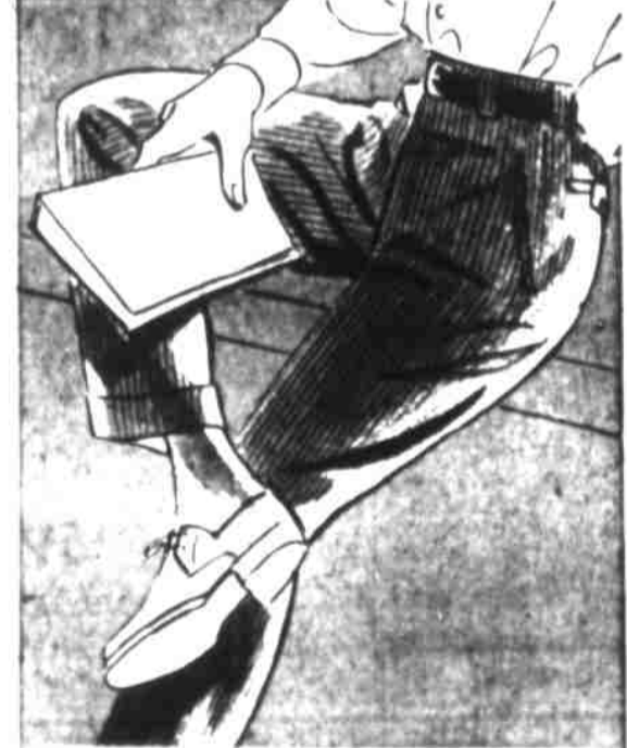
Genuine Hockmeyer White Cords for Boys

Styled for school or casual wear in Penney's popular coast model! Cut over Penney's generous proportioned patterns for non-binding comfort! Machine washable. Sizes 4 to 8—4.40