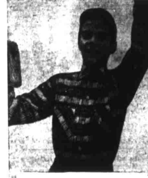
Flannel Shirts for Boys Colorful New Plaids!

Warm, 5.2-ounce machine washable Sanforized cotton flannel! Penney styled with short round 4 collar, 2 plain pockets. Won't shrink more than 1%.