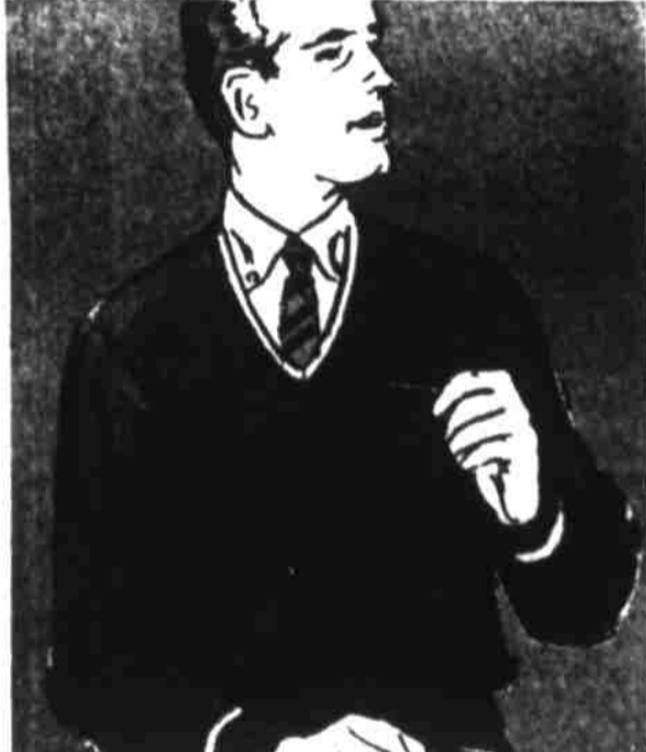
A Dash of Contrast In Australian Lambs Wool...

Styled with contrasting trim for extra fashion! Towncraft cashmere-look, cashmere-soft Lambswool Slip-overs... finely interlocked knit for unbelievably long wear. Wash in a jiffy, need no blocking.