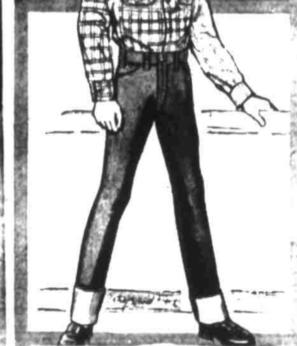
Slim, Trim Westerns In 13 3/4-ounce Denim!

Penney's Foremost... tops for rugged wear and value... features authentic rodeo styling in 13 3/4-ounce Sanforized! vat-dyed super denim. Ruggedly reinforced thruout. Machine wash. Won't shrink more than 1%.