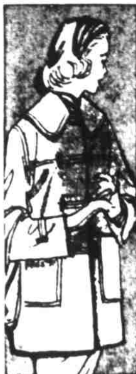
Going Full Speed Ahead, Into Fall Fashion!

Big news driving coats made to travel everywhere you do... Sleek, modern streamlined... Penney-priced to save you money! Meticulously tailored, styled with deep pockets, wood buttons... rain-shedding of course.