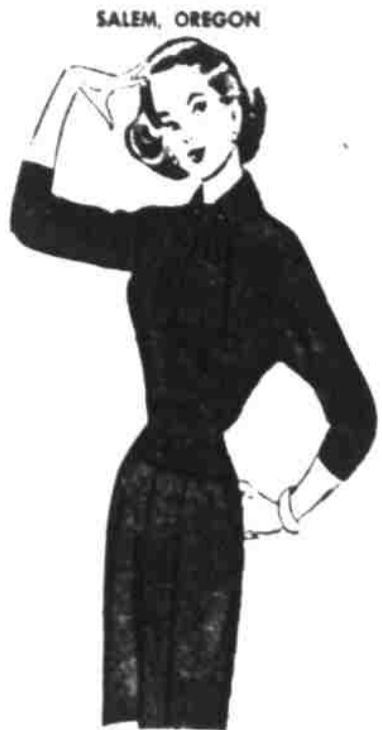
SALEM, OREGON Perfectly Color-Matched Wool Coordinates

Creamy, soft 100% wool flannel. The lamb's wool sweater is full-fashioned; can be worn with tie and tab; with tab alone; or open without tab or tie.