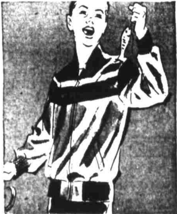
Striped Reversibles Of Washable Nylon!

Top Penney buy! Fleece striped side reverses to smooth, water repellent taffeta for all-weather wear. 100% nylon, soft, warm, rugged. Machine wash in lukewarm water.