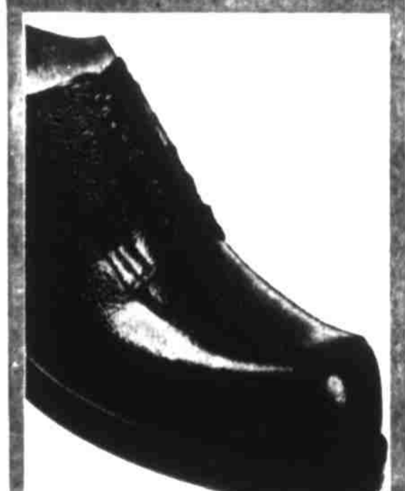
Scotch Grain Cordovan Color Brogues

Luxurious, crafted shoe of fine quality scotch grain leather in the popular cordovan color. Built-in heel top plus composition sole.