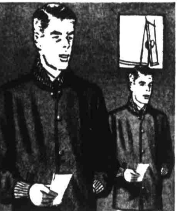
Our new all wool melton has Sharp Knit Trims

Handsome fingertip-length campus coat has snap-front, wool-cotton-and-nylon knit trims on collar and cuffs. Fully rayon lined. Colors are light grey, natural blue, red, charcoal.