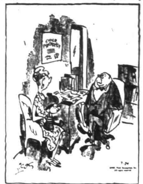
Of course, this isn't Junior's ordinary behavior, doctor! I've got a hammerlock on him!