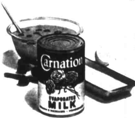
*from Continental Cans

Mix strawberries with marshmallow topping in bowl. Allow to stand 25 minutes, stirring occasionally. Meantime, chill Carnation in refrigerator tray until soft crystals form through milk (25-30 minutes). Whip Carnation until stiff (2 minutes). Add lemon juice; whip very stiff (2 minutes more). Blend with strawberry mixture. Place in refrigerator trays. Freeze until firm (about 3 hours). No more stirring needed!