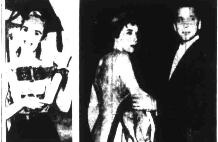
Grad HOLLYWOOD, June 20—Actress Molly Bee, a teenager making her motion picture debut in Universal-International's "Summer Love," was graduated from the studio's Little Red School House high school division in this manner today. She was the loan graduate and because of the warm weather appeared in this garb.