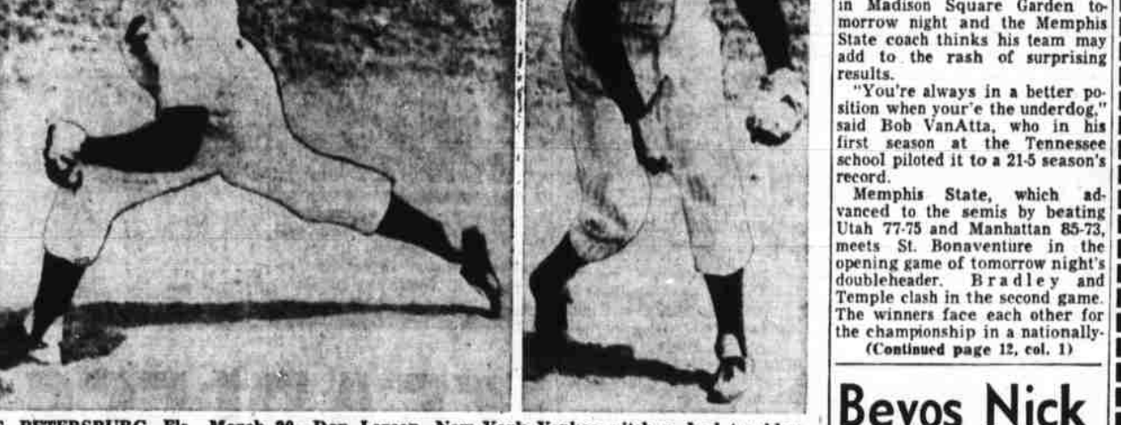
ST. PETERSBURG, Fla., March 20—Don Larsen, New York Yankee pitcher, had troubles today as he allowed Cincinnati Reds five runs on six hits in three innings he worked in first appearance of spring training season. Larsen is shown at left as he pitched in first inning and at right watches ball hit by George Crowe sail over right field wall.