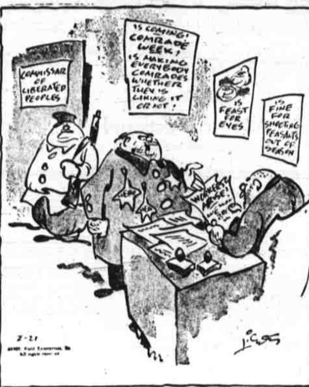
"Is proof rebellions are stimulated by capitalist warmongers? . . . Satellite peoples are demanding clothes to wear and food to eat! . . ."