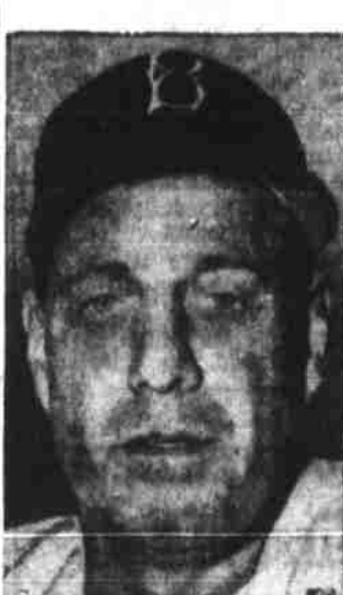
LEO DUROCHER Tribe seeks his services