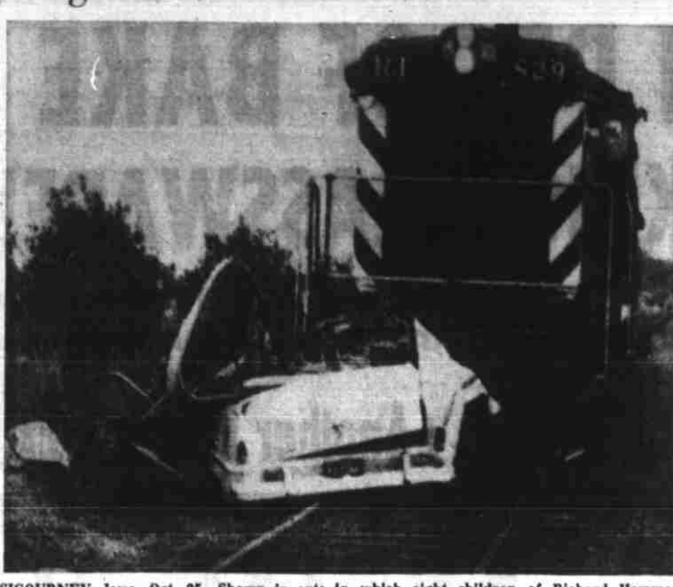
SIGOURNEY, lowa, Oct. 25-Shown in auto in which eight children of Richard Hammes, 11/2 ml. east of Sigourney, died this morning. Accident occurred 2 mi. east, 1/2 ml. north of Sigourney. A body "covered" left foreground. Car was dragged 864 feet down track.

Eight Children Die in Auto-Train Wreck Valley Stock