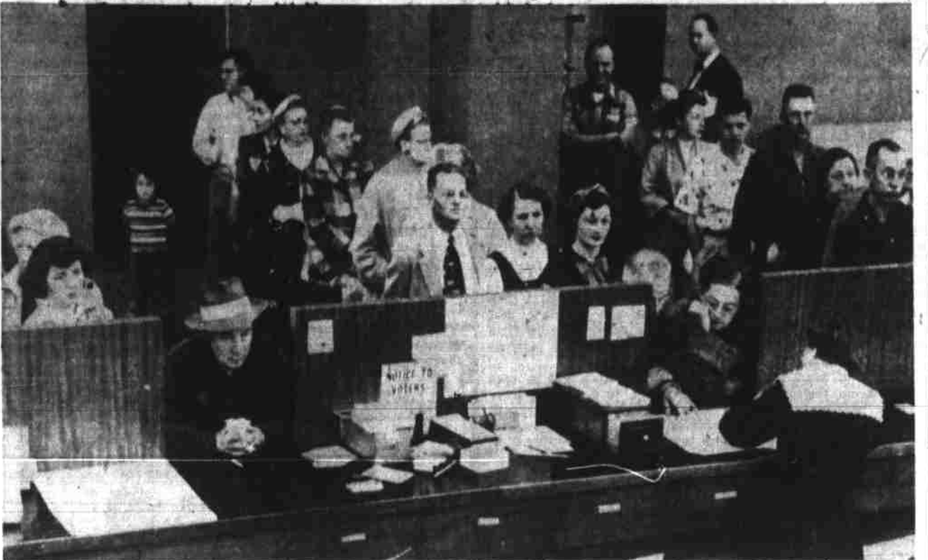
As the Saturday deadline for voter registration neared, the courthouse Friday. The clerk's office in the courthouse will be open until 8 o'clock tonight to receive registrations.