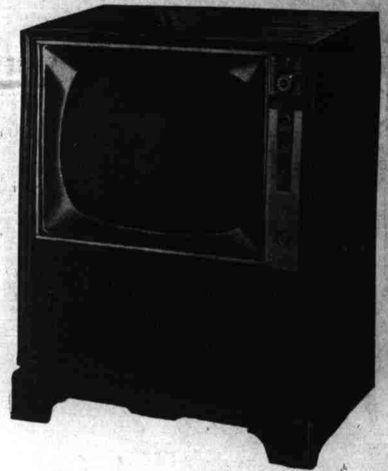
21C160 1957 Model

Table model in Bermuda Bronze finish... blend of contemporary and functional styling... designed to harmonize with modern and period furniture. Features GE's aluminized picture tube... tinted clear safety glass insures a glare-free picture. (Matching base as shown available for 19.95). (VHF only, 179.95).