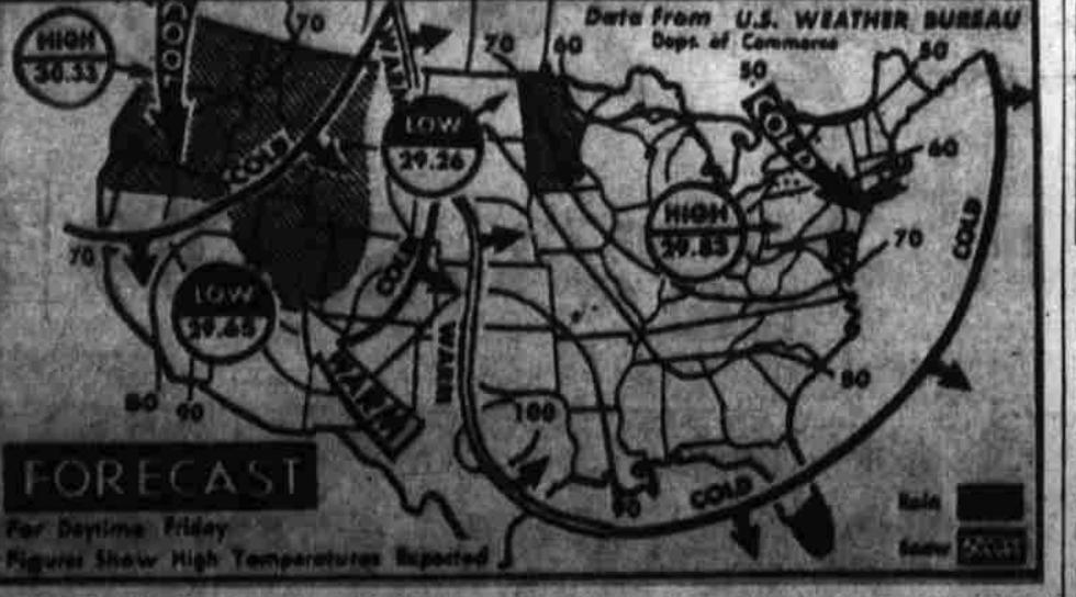
West Wet The eastern half of the nation will have clear to partly cloudy skies Friday except for few snow flurries in lower Lakes region and rain in Minnesota. Rain is also expected from north Pacific coast to Rockies. It will be cool in northern part of U. S. except for warmer weather in Mississippi Valley.