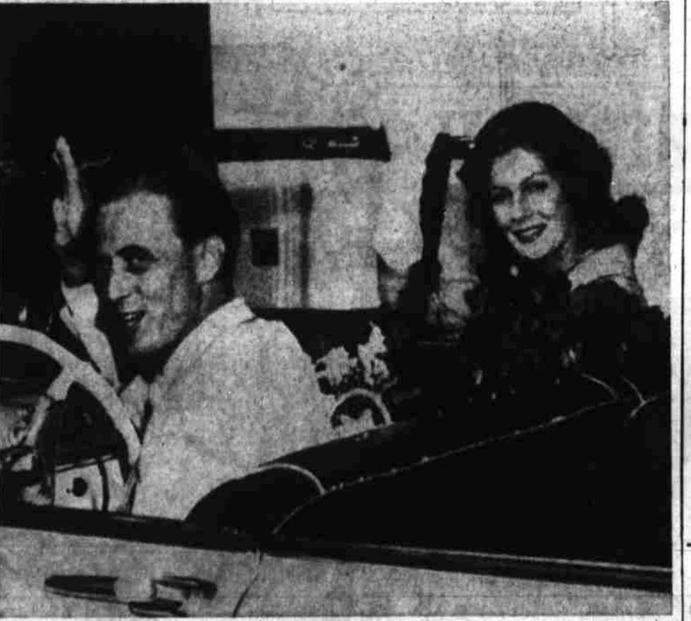
Baron and Bride LUGANO, Switzerland, Sept. 20—Baron Heinrich Thyssen, 35, Swiss industrialist, and his bride, the former Fiona Campbell-Walter, 24, London model, wave from car as they leave the Baron's villa here enroute to Italy for honeymoon. It was third marriage for the Baron in 10 years.