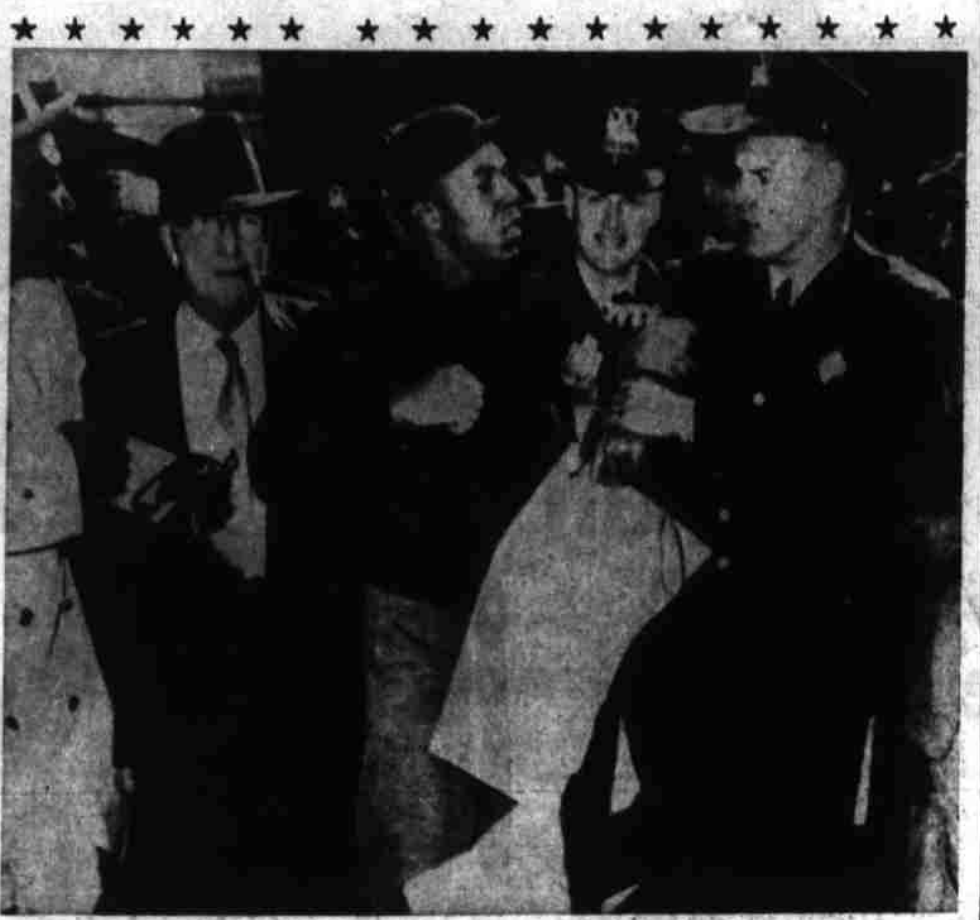
Arrests Made CHICAGO, Sept. 20—Pickets on line at Swift & Co., nation's largest meat packer, create trouble for police as they prevent arrest of one of their members Thursday. There were sporadic arrests at Chicago's sprawling stockyards as two unions involved in strike threw up picket lines and halted employees of other packers at 14 entrances for gate identification checks.