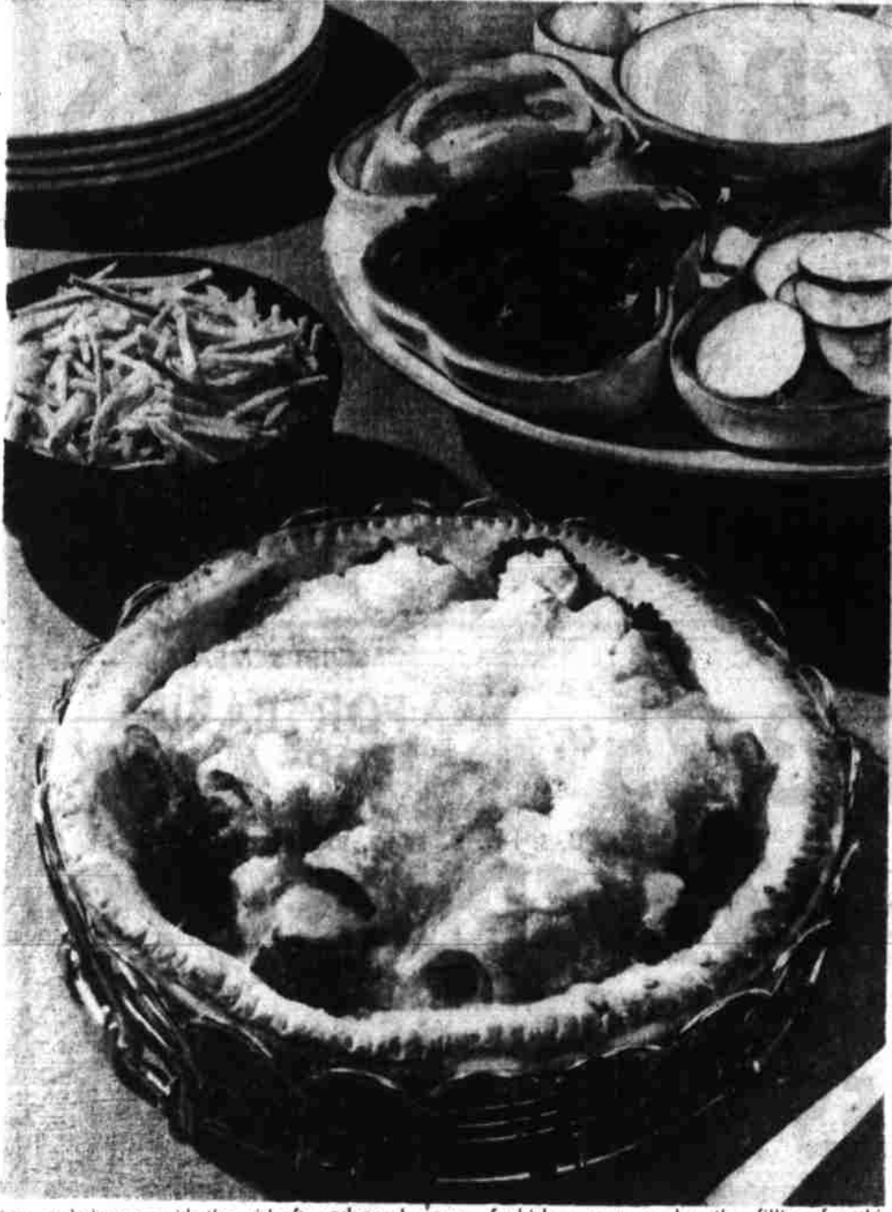
Ham and cheese, with the aid of condensed cream of chicken soup, makes the filling for this attractive pie. Pretty enough for a buffet menu, it goes here with a make-it-yourself salad assortment and shoestring potatoes.

The Statesman's Food SECTION Ore. Statesman, Fri., Sept. 21 (Sec. III)-19