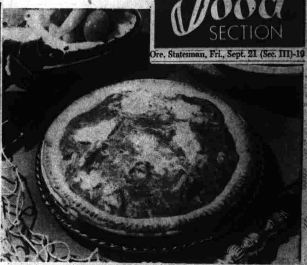
Fish fillets distinguish this main dish pie, and they gain flavor from just the right seasoning of curry. The filling is prepared about half hour before dining time and spooned into the prepared crust and baked.