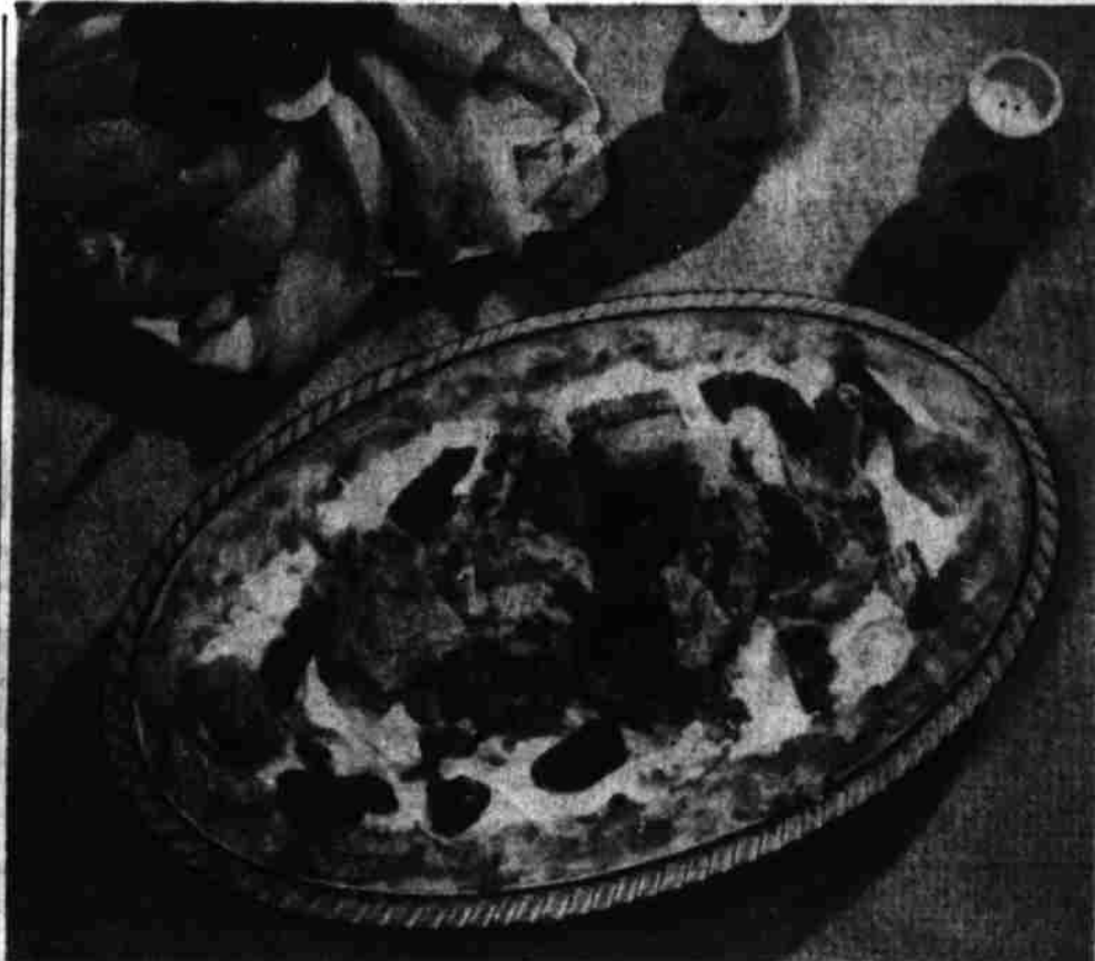
Pimiento-salmon pie makes a handsome main dish for autumn eating. Mashed potatoes, shredded cheese, onion and a creamy sauce further conspire to make this an unusually good recipe. The potatoes form the crust this time.