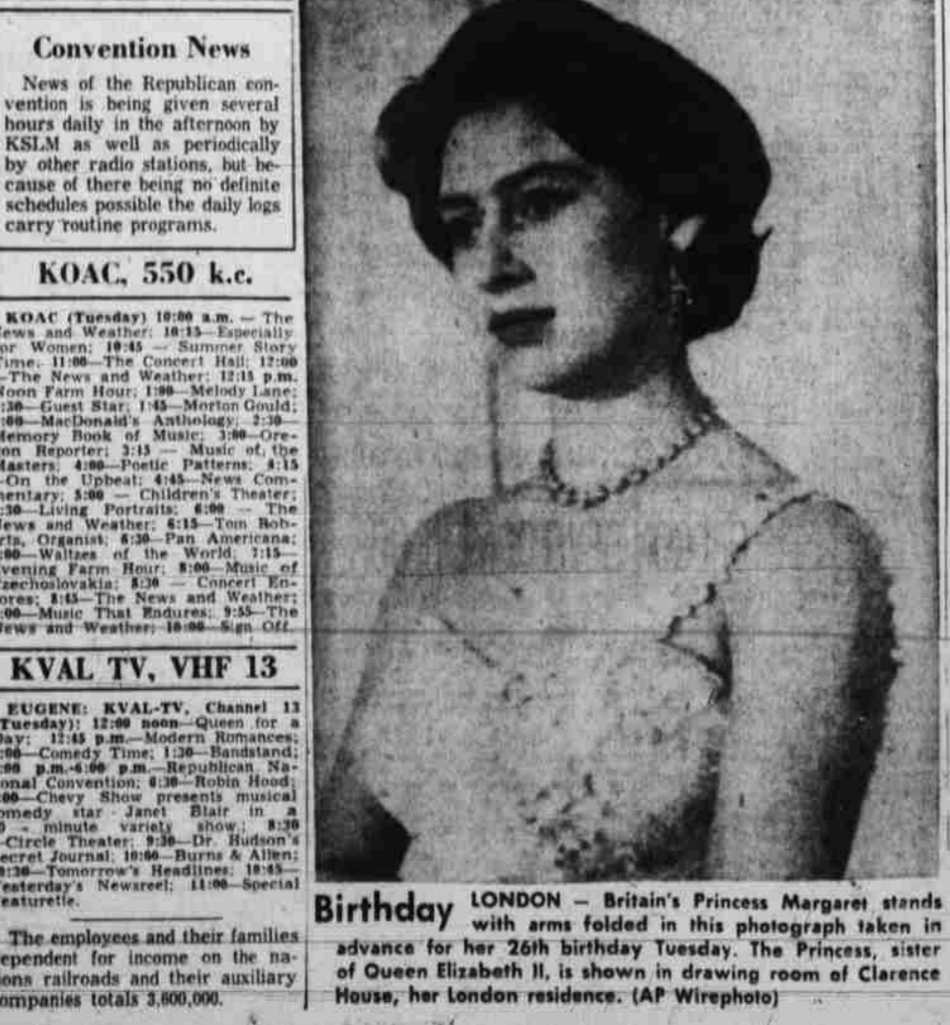
Birthday LONDON — Britain's Princess Margaret stands with arms folded in this photograph taken in advance for her 26th birthday Tuesday. The Princess, sister of Queen Elizabeth II, is shown in drawing room of Clarence House, her London residence.