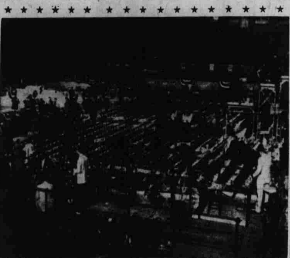
Delegates Slow SAN FRANCISCO — Less than an hour before the scheduled start of the Republican convention's first session Monday, only a scattered handful of delegates and photographers busily setting up their equipment were on hand.