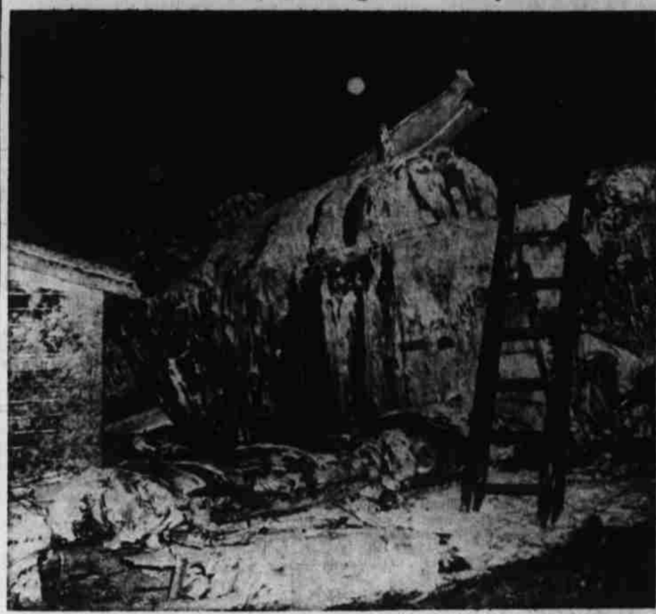
Wreckage of a Navy attack bomber rests against a rabbit house on the C. M. Woods property on Liberty Road following a fiery crash Saturday night. Pilot of the craft, Lt. (j.g.) Donald J. Playans, parachuted to safety after the ship caught fire.

Loaded Truck Topples, Kills Young Driver WOODBURN — A 22-year-old Woodburn youth was killed Saturday afternoon when the truck he was driving rolled over on the Woodburn-Mollala road near Pudding River bridge.